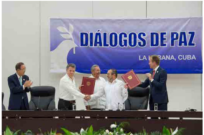
Secretary-General Attends Ceremony for Colombian Ceasefire Agreement, Havana.

Mr. Ban expressed admiration for the negotiating teams, which he said have demonstrated that it is possible to “achieve peace with dignity for all concerned.”