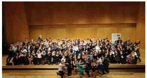
UN Youth Australia at the National Conference