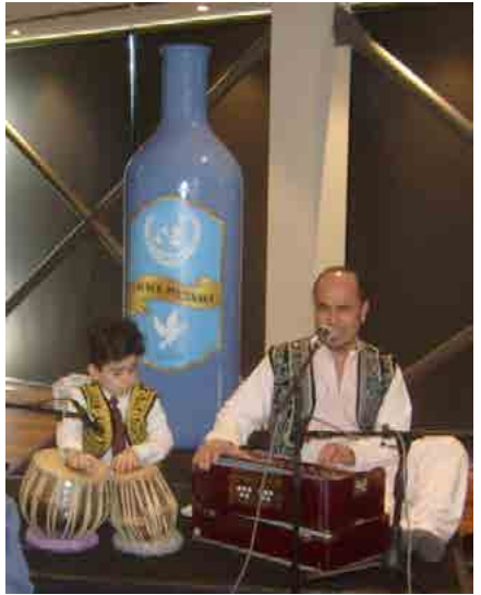
Father and son musicians