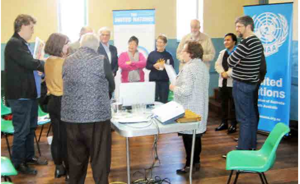
After the AGM the new committee held a brief meeting

UNAA SA achievements over the previous twelve months are comprehensively documented in our annual report, copies of which are readily available in the office, on-line or by mail at a small cost. We now look forward to an especially successful year ahead.