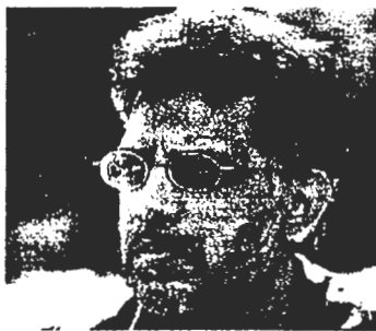
Blunt: Miloon Kothari.

He also "reminds the Government that retrogressive