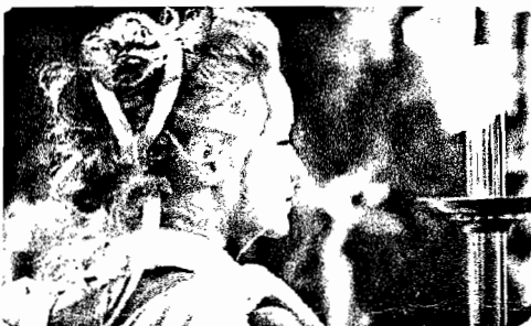
CIPFG – Australian chapter:

Free China National Civic Council Edmund Rice Centre Darfur Australia Network Doctors Against Forced Organ Harvesting Federation of Vietnamese Community in Australia Federation for a Democratic China Human Rights Arts & Film Festival Women's International League for Peace & Freedom (WILPF)