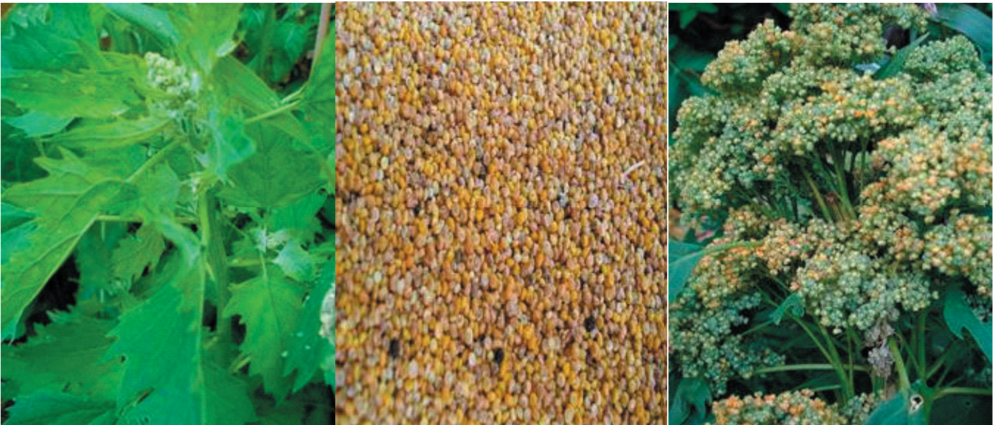
Quinoa leaves contain oxalic acid.

The saponins, which contain glycoside, in the quinoa husks are useful in the manufacture of laundry detergent. The leaves contain oxalic acid which can be poisonous, and should not be eaten to excess.