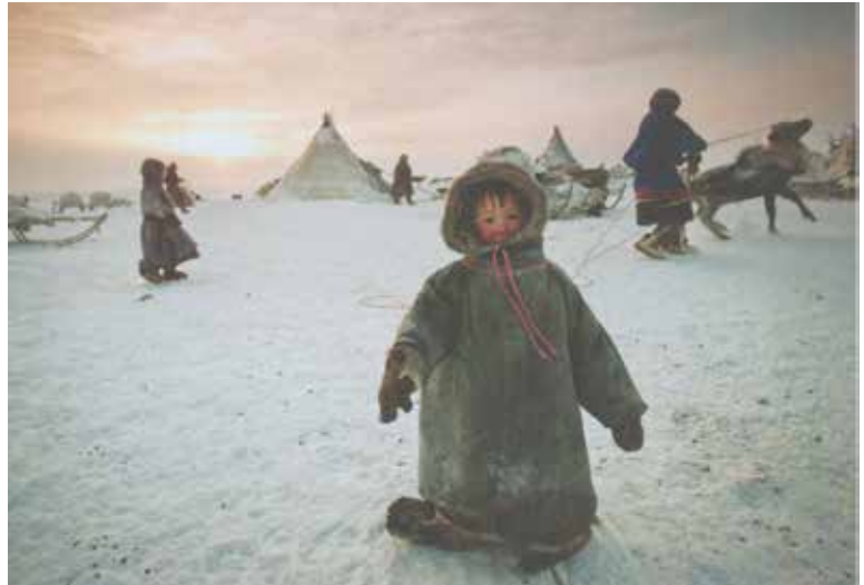
Five Cards, Blank Inside, RRP 12.95 ($10 for members).