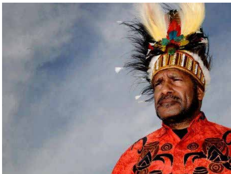
Benny Wenda is on a mission: Free West Papua