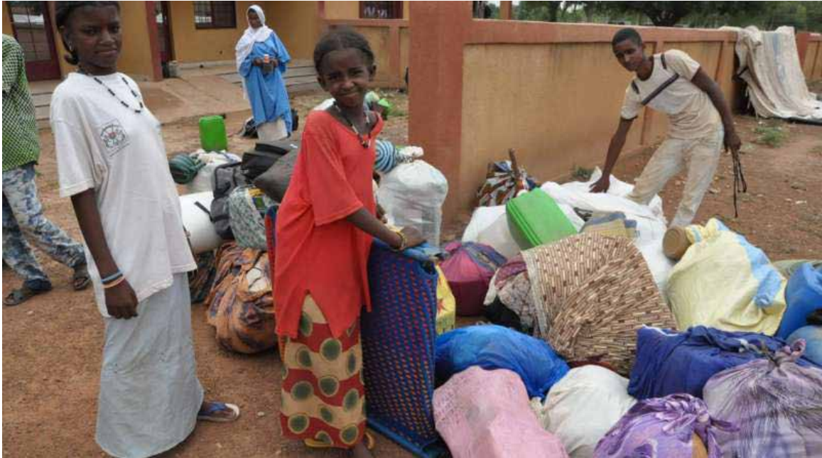
Malian refugees with their belongings after arriving at Goudebou camp in Burkina Faso.

16 March 2013 – The United Nations could have a peacekeeping operation in place in Mali this July, with approval from the Malian Government and the Security Council, a senior United Nations official today said wrapping up his week-long visit to Mali.