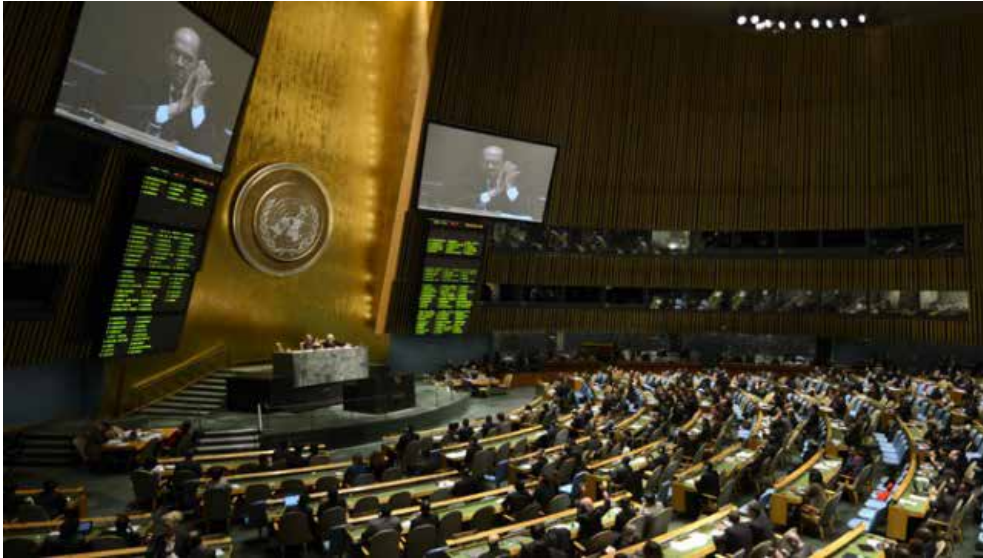
Delegates to the United Nations General Assembly on April 2, 2013 applaud the passage of the first UN treaty regulating the international arms trade

The United Nations General Assembly has overwhelmingly voted to adopt the first ever treaty regulating international arms trade. Nonetheless, abstentions from major exporters and importers may limit its effectiveness. 154 countries voted for the treaty in New York, while Iran, Syria and North Korea voted against, and 23 countries abstained.