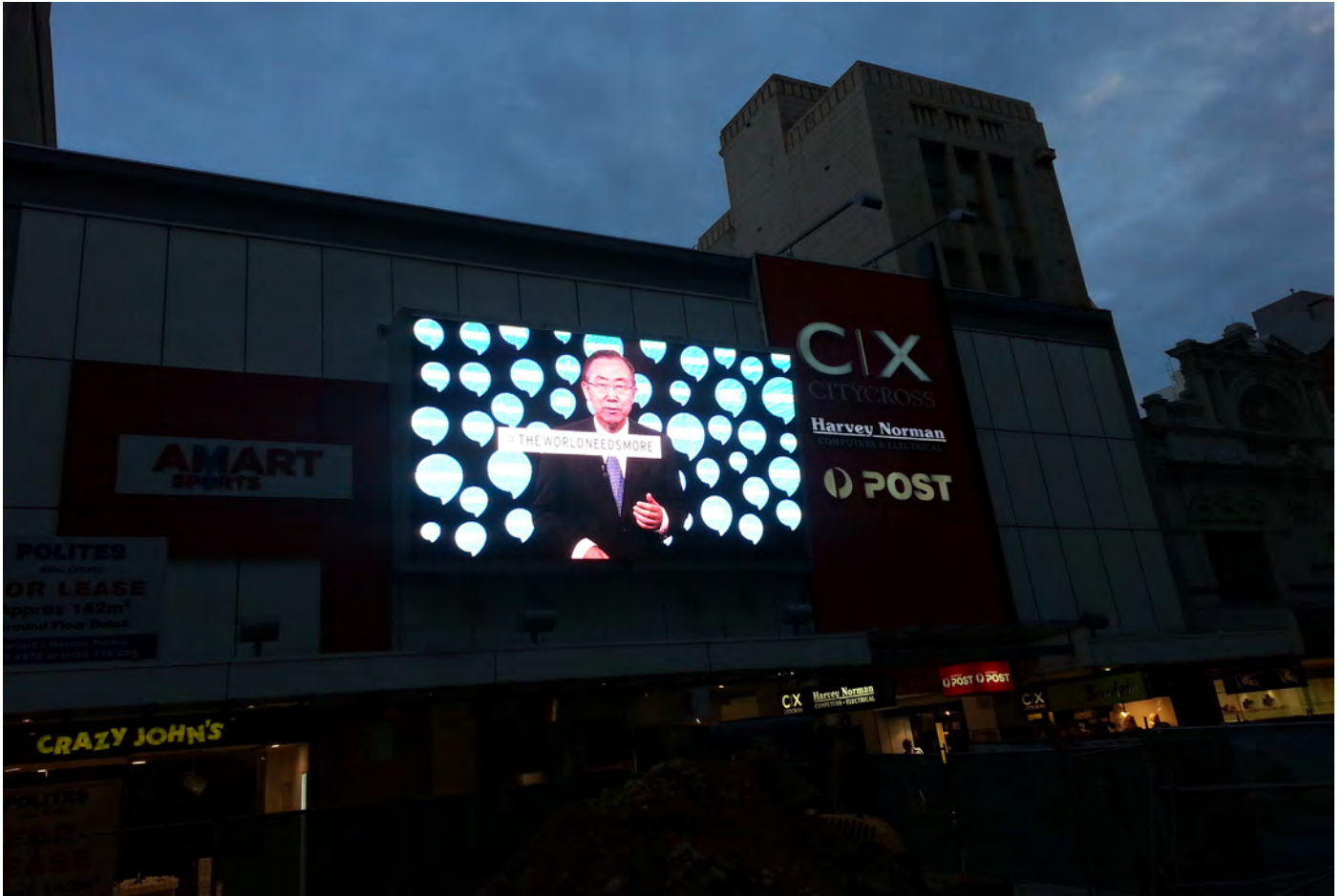
UN Secretary General Ban Ki Moon giving his Humanitarian Day message on the big screen in Rundle Mall