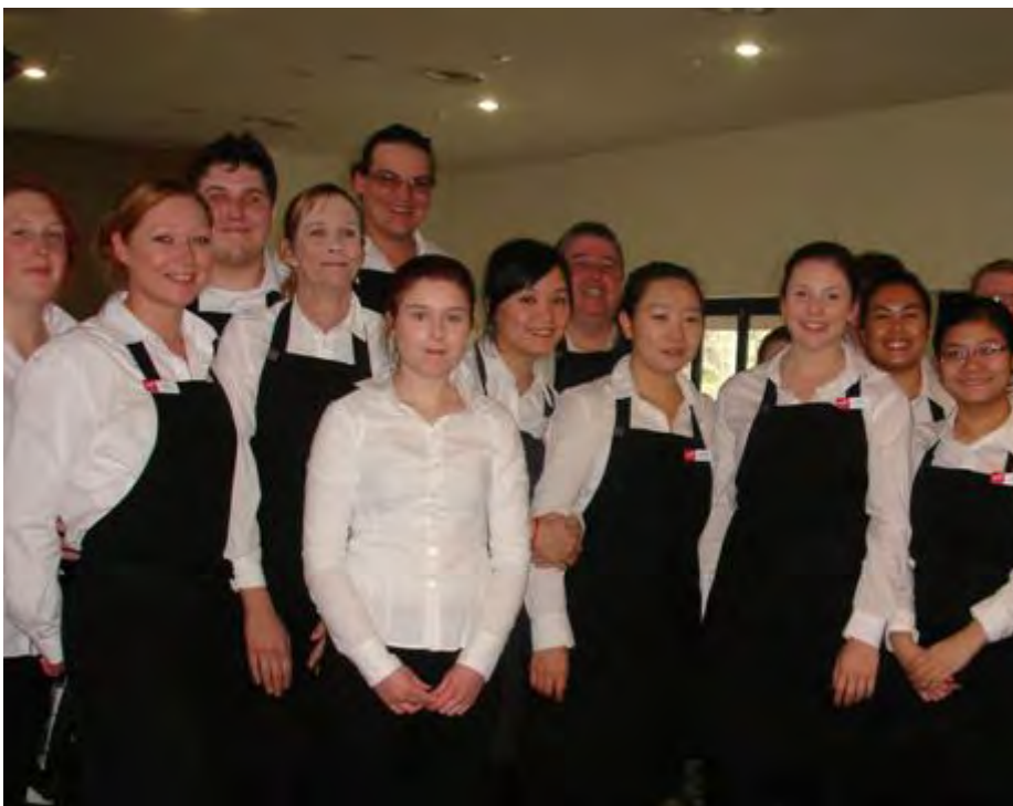
Hospitality Students of Tafe SA Regency Campus