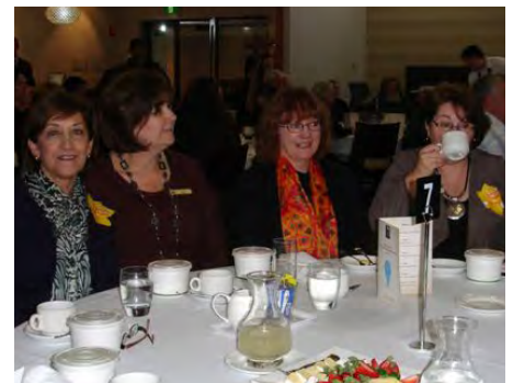
Guests at the luncheon.