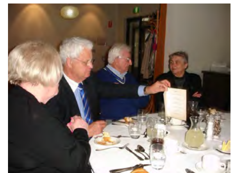
Guests at the luncheon.