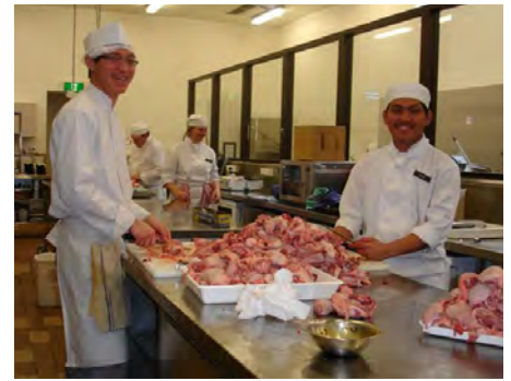
Hospitality Students of Tafe SA Regency Campus